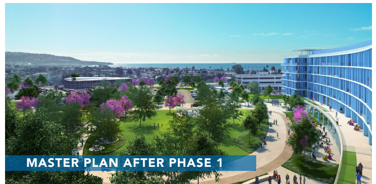
MASTER PLAN AFTER PHASE 1

After certifying the Final Environmental Impact Report (EIR) for the BCHD Healthy Living Campus Master Plan in September 2021, the BCHD Board of Directors approved the campus project Master Plan during their November 2021 meeting. The 5-0 vote, which followed 3 ½ hours of presentation, public comments and deliberations, addresses potential impacts by: